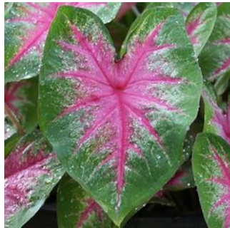
“Rosebud” – Pink