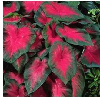
“Fla. Cardinal” – Red